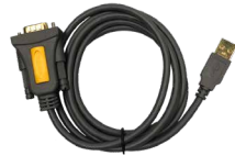
1 x DB9 Male to USB Type A Male Converter Cable