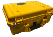
1 x David30 Base Carrying Case