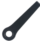
1 x Height Measure Accessory