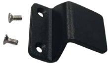
1 x Hook and Screws for David30