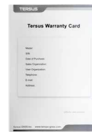
1 x Warranty Card