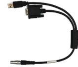
1 x COMM2-7pin to USB & DB9 Female Cable