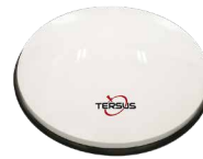
1 x AX4E02 GNSS Antenna