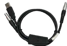
1 x COMM2-7pin to USB & 2W-Radio-5pin Cable