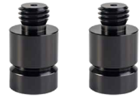
2 x GNSS Antenna Connector