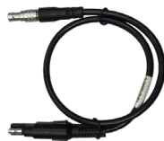
1 x DC-5pin to Bullet-DC Power Cable