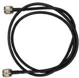
1 x TNC-J to TNC-J Cable 1m (GNSS Antenna Cable)