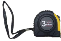
1 x Tape Measure