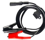
1 x Bullet-DC to Alligator Clips