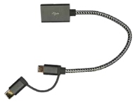
1 x USB Type A Female to USB (Micro+Type C) OTG Cable