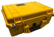
1 x Carrying Case for Oscar Rover+Base