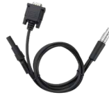
1 x Configuration Cable for External Radio

[1] The model of the cable will be delivered according to customer requirements.