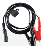
1 x Bullet-DC to Alligator Clips