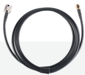
1 x TNC-J to SMA cable 1.5m (GNSS antenna cable)