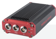
1 x David GNSS receiver