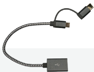
1 x USB Type A Female to USB (Micro+Type C) OTG cable