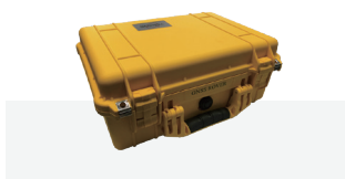
1 x carrying case