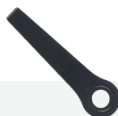
1 x height measure accessory