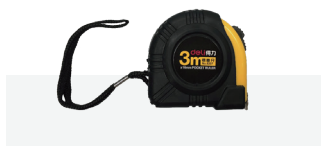
1 x tape measure