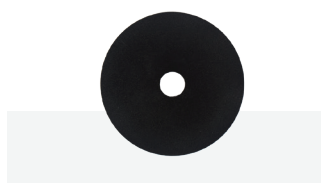
1 x Metal plate for radio antenna