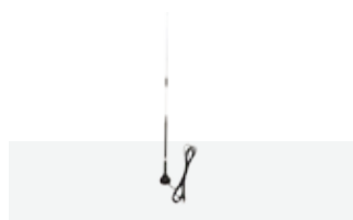
1 x High Gain Radio Antenna