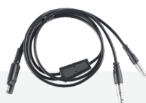
1 x DC-2pin & 30W-Radio-DC-2pin to Bullet-DC