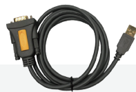
1 x DB9 Male to USB Type A Male converter cable