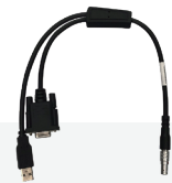
1 x COMM2-7pin to USB & DB9 Cable