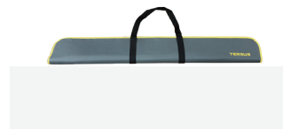
1 x toolbag