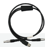
1 x COMM2-7pin to USB & 30W-Radio-5pin Cable