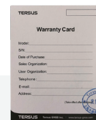
1 x warranty card